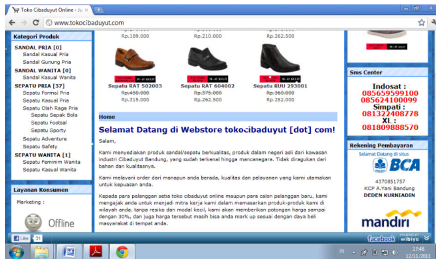
Image 1. tokocibaduyut.com Website

order because many online stores also provide the tariffs of delivery services. Here's one screen view of one online store website: